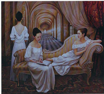
The Dust, 2014, oil on canvas, 150 x 150cm