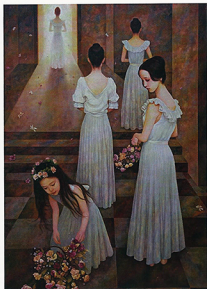
Girls and Flowers, 2014, oil on canvas, 160 x 105cm