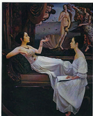
The Dream of Classicity, 2015, oil on canvas, 146 x 158cm