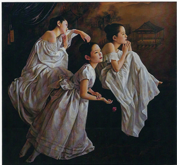
The Spring, 2015, oil on canvas, 150 x 150cm