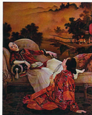
Left: A Sitting Girl, 2014, oil on canvas, 90 x 60cm The Summer, 2015, oil on canvas 145 x 138cm