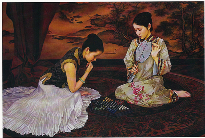
Chinese Checkers, 2015, oil on canvas, 130 x 97cm